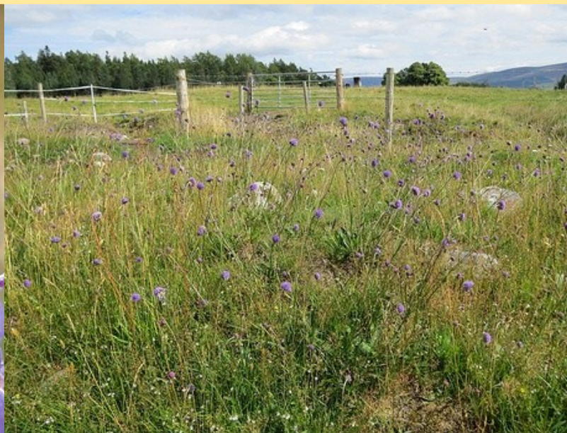
Left: Female Andrena marginata ; Right: Granttown-on-Spey 'Mossy, Spey Valley (typical habitat)

The Small scabious-mining bee's name is derived from its dependence on pollen from flowers of Devil's-bit scabious. It is known to forage for nectar on a range of other wildflowers including Creeping thistle and knapweed. Males are black or dark brown with a white face. Female abdomen colour varies: some appear black or dark brown (similar to males), others have orange and black bands, while some females are predominantly orange (rare in Scotland). This species is on the Scottish Biodiversity List and is classified as Red Data Book Notable A. It is a species for priority action in the Cairngorms Nature Action Plan.