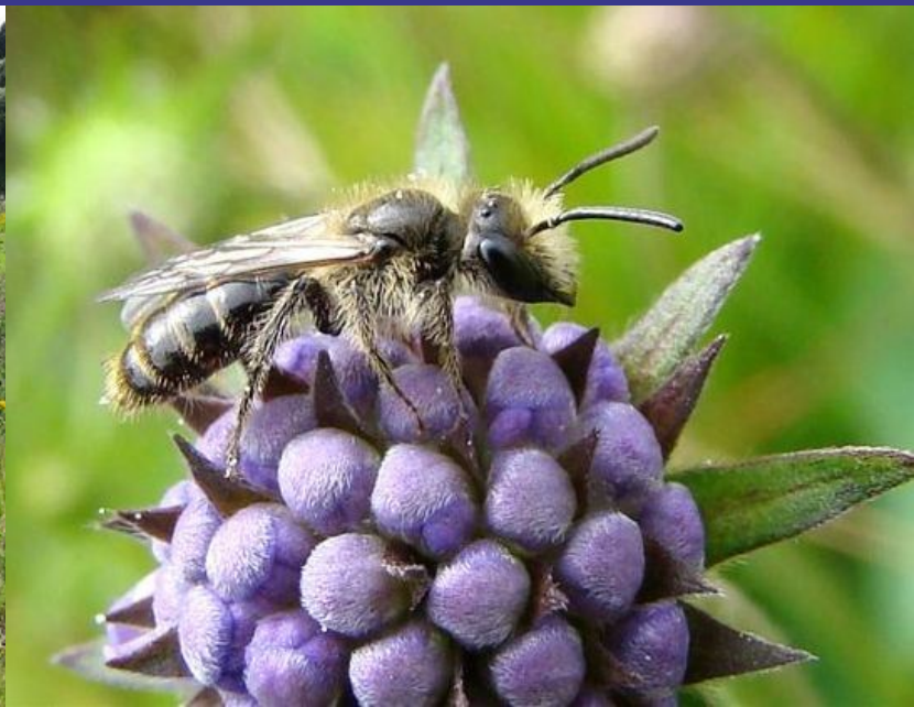
Left: Granish Moor, Spey Valley (typical habitat); Right: Male Andrena marginata

likely due to habitat loss, fragmentation and deterioration due to over-grazing, inappropriately timed grass cutting, and scrub encroachment. Loss of suitable habitat to development is another threat.