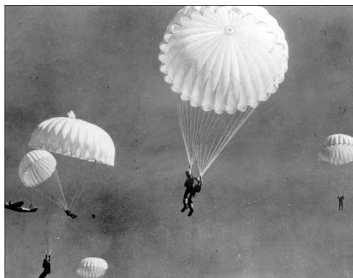
Parachutes reduce the risk of injury after gravitational challenge, but their effectiveness has not been proved with randomised controlled trials